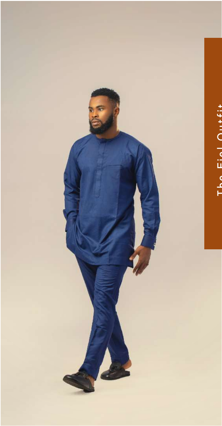
The Fiel Outfit