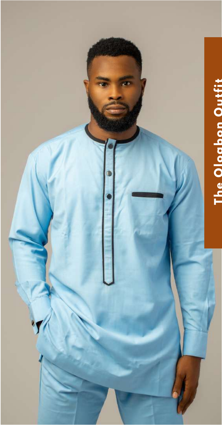
The Ologbon Outfit