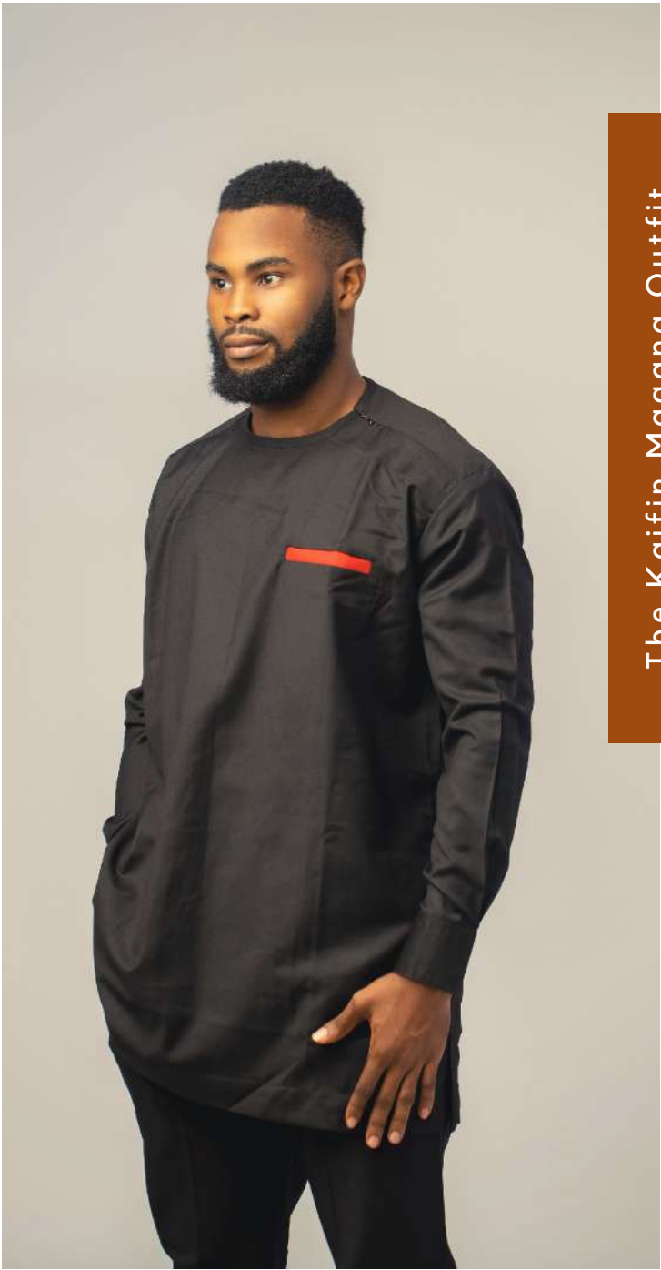
The Kaifin Magana Outfit