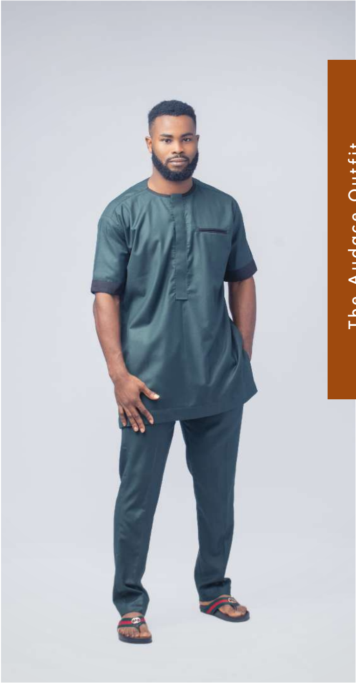
The Audace Outfit