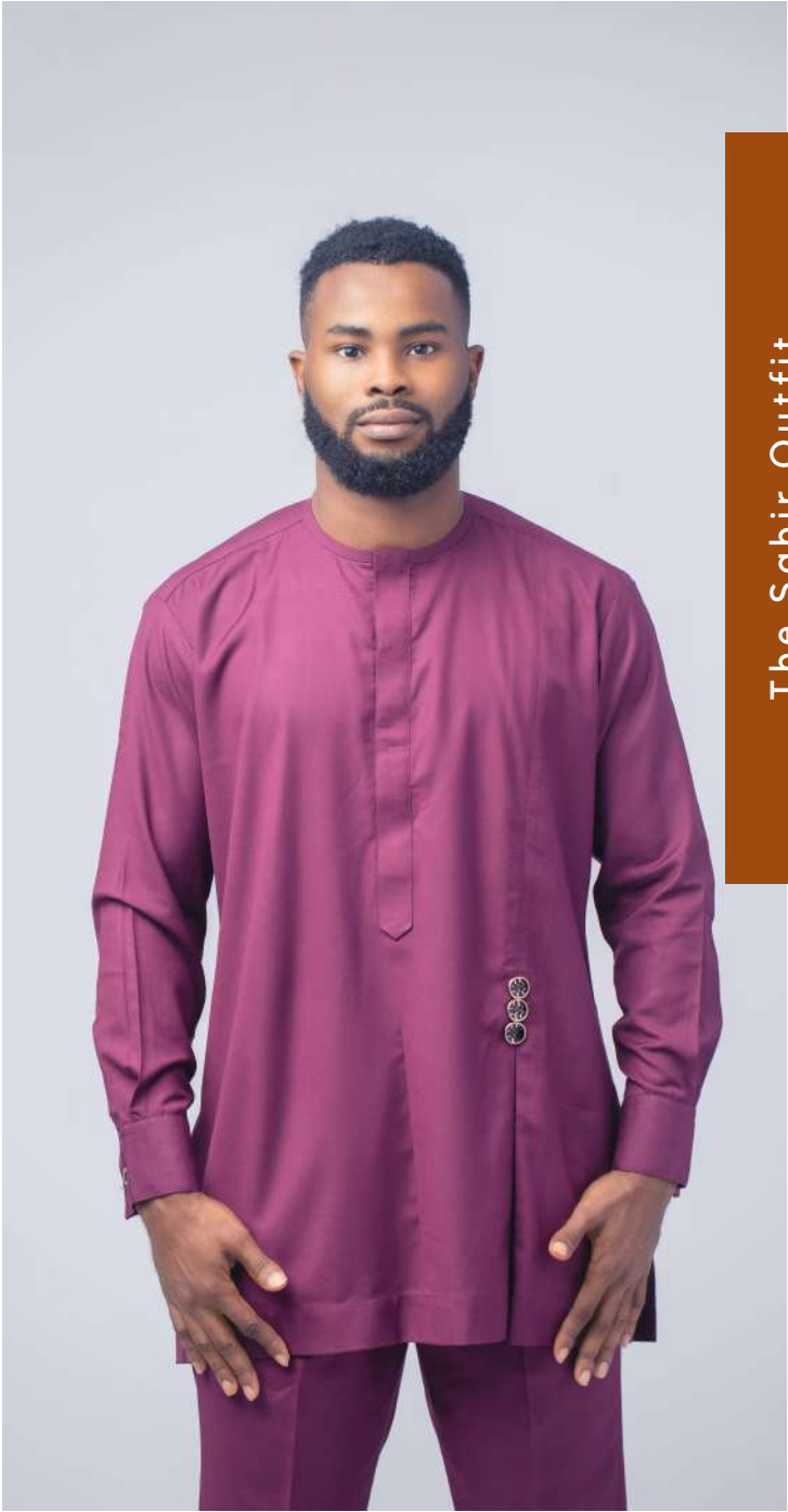
The Sahir Outfit