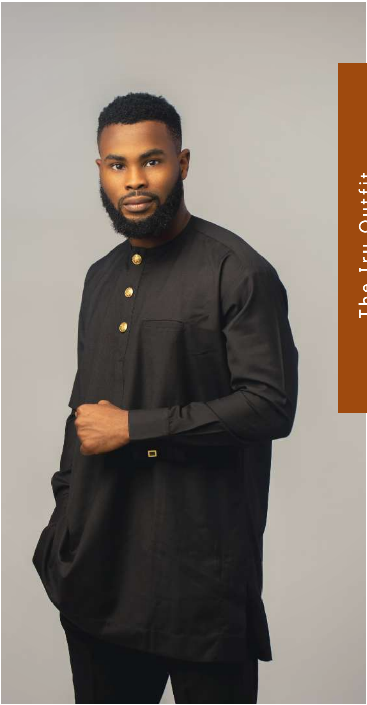
The Iru Outfit